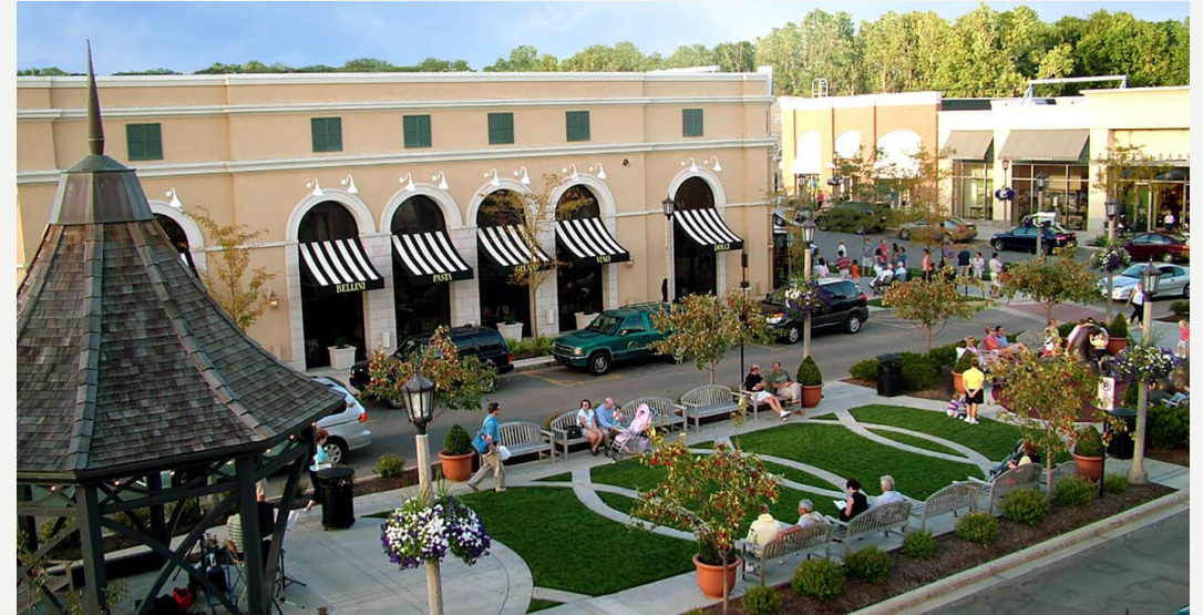
The Village of Rochester Hills