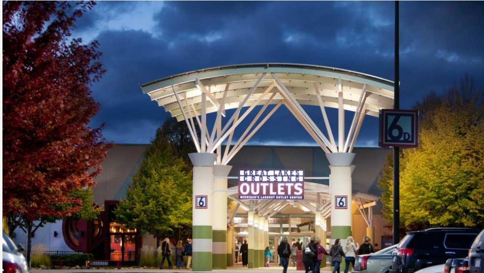
Great Lakes Crossing Outlets