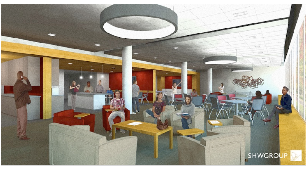
Medical Student Lounge, Estimated Date of Completion: Winter 2013